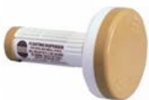
#231007 Floating Bromine Dispenser For use in CRYOThermS installed prior to 2016. Starting in 2016 in-line bromine dispensers were included with the cartridge filter assembly.