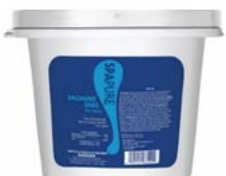
#231001 Bromine Tablets