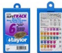
#231301 7-way Test Strip 50 ct. *